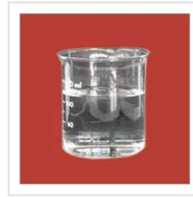
Calcium Chloride Solution