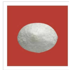
Calcium Chloride Anhydrous Powder