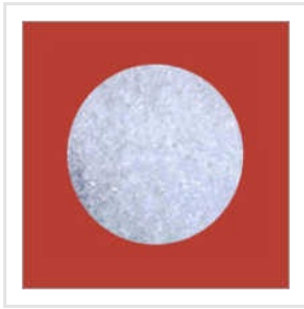
Crystal Sodium Acetate Trihydrate