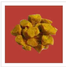
Ferric Chloride Hexahydrate Lumps