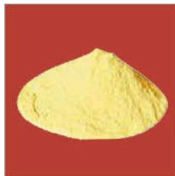
ANTIMONY PENTOXIDE POWDER