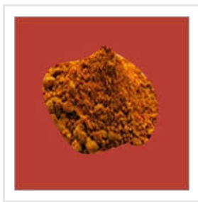
Ferric Chloride Anhydrous Powder