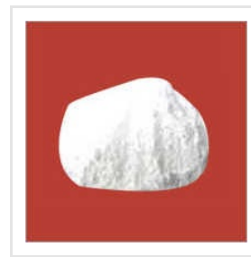
Sodium Acetate Anhydrous Powder