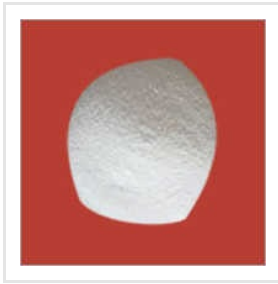
Ammonium Chloride Powder