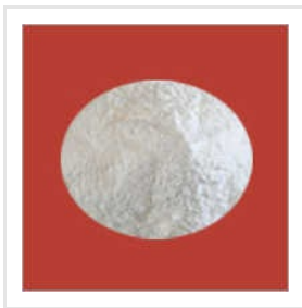
Calcium Chloride Dihydrate Powder