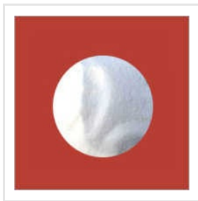
Sodium Bromide Powder