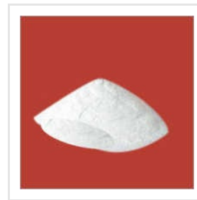
Antimony Trioxide Powder