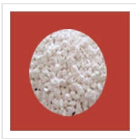
Solid Calcium Chloride Powder