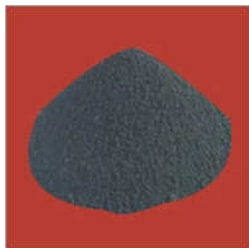
ANTIMONY TRISULPHIDE POWDER

Ammonium Bi Fluoride Powder, Ammonium Chloride Powder, Ammonium Fluoride Powder, Ammonium Sulphate Powder, Antimony Pentachloride Solution, Antimony Pentasulphide Powder, Antimony Pentoxide Powder, Antimony Trichloride Powder, Antimony Trioxide Powder, Antimony Trisulfide Powder, Antimony Trisulphide Powder, Calcium Bromide Powder, Calcium Carbonate Powder, Calcium Chloride Anhydrous Powder, Calcium Chloride Dihydrate Powder, etc.