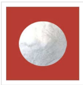
Potassium Acetate Anhydrous Powder