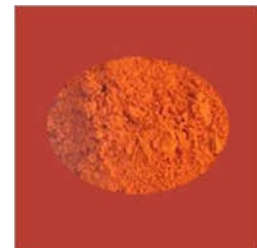
ANTIMONY PENTASULPHIDE POWDER