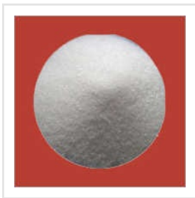
Calcium Bromide Powder