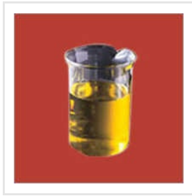
Antimony Pentachloride Solution