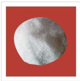
Antimony Trichloride Powder